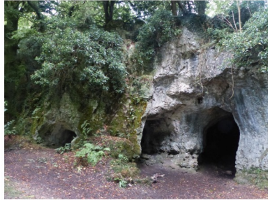
King Arthur's Cave is also linked in legend with King Vortigern, a native British king who fought against the invading Anglo Saxons. More convincingly, the cave is known from archaeological excavations to have housed Stone Age people who left flint tools and mammoth bones behind. Material removed during the dig is still visible as a mound in front of the entrance.