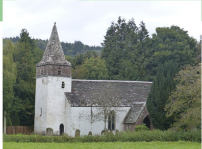
St Peter's Church, Dixon, is flooded so often that a new gallery has been built inside to store valuables out of harm's way, and they don't even bother marking the flood height with a plaque unless it's more than three feet deep! The church dates back to Norman times though it may include some Saxon material. Despite being in Wales, the church belongs to the Church of England, and as an indirect result was the first in Wales to have a woman priest celebrate Holy Communion.