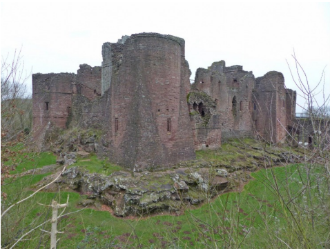
Goodrich Castle has been described as "one of the best examples of English military architecture". The oldest part is the keep, dating from the mid-11th century; the concentric outer fortifications were added in the late 13th century. The cylindrical towers with right-angled projections, designed to be difficult to undermine during a siege, are typical of castles in the Welsh Marches.

1 From the front door of the pub, facing the river, turn right. 2 Turn off the road and walk through the car park and campsite on your left to the far corner, where a gate gives access to a riverside meadow. 3 Follow the riverbank as far as the ferry to the Old Ferrie Inn, then