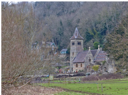
The tiny village of Welsh Bicknor , tucked between wooded hills and the River Wye, consists of little more than an isolated Victorian church, a railway tunnel and bridge, and the former rectory, now a Youth Hostel.