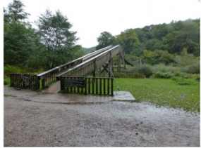
The footbridge at Biblins was built in the 1950s by the Forestry Commission, and refurbished in the 1990s. A sign advises that no more than six people should cross at once.