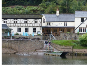
The hand ferry at Symonds Yat is operated on request by the staff of the Saracens Head. In 1800 there were 25 similar hand ferries between Ross and Chepstow.