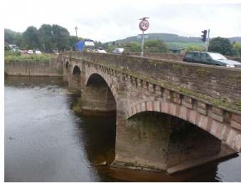
Wye Bridge, Monmouth, carries the A466 over the river. The bridge was built in about 1615, and the original narrow arches can be seen beneath the wider arches and parapet added in the 19th century.