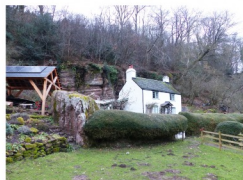
Huntsham Cottage , surrounded by rocky boulders, is a key element of the view from Yat Rock.