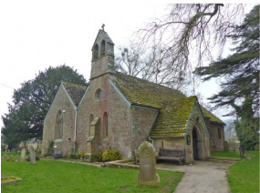
The riverside Church of St Dubricius at Whitchurch was rebuilt in the 14th century and restored in the 19th.