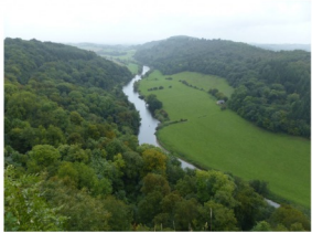
The view from Yat Rock.