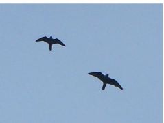
Peregrine Falcons nest on the cliffs east of Yat Rock, but can be seen year round.